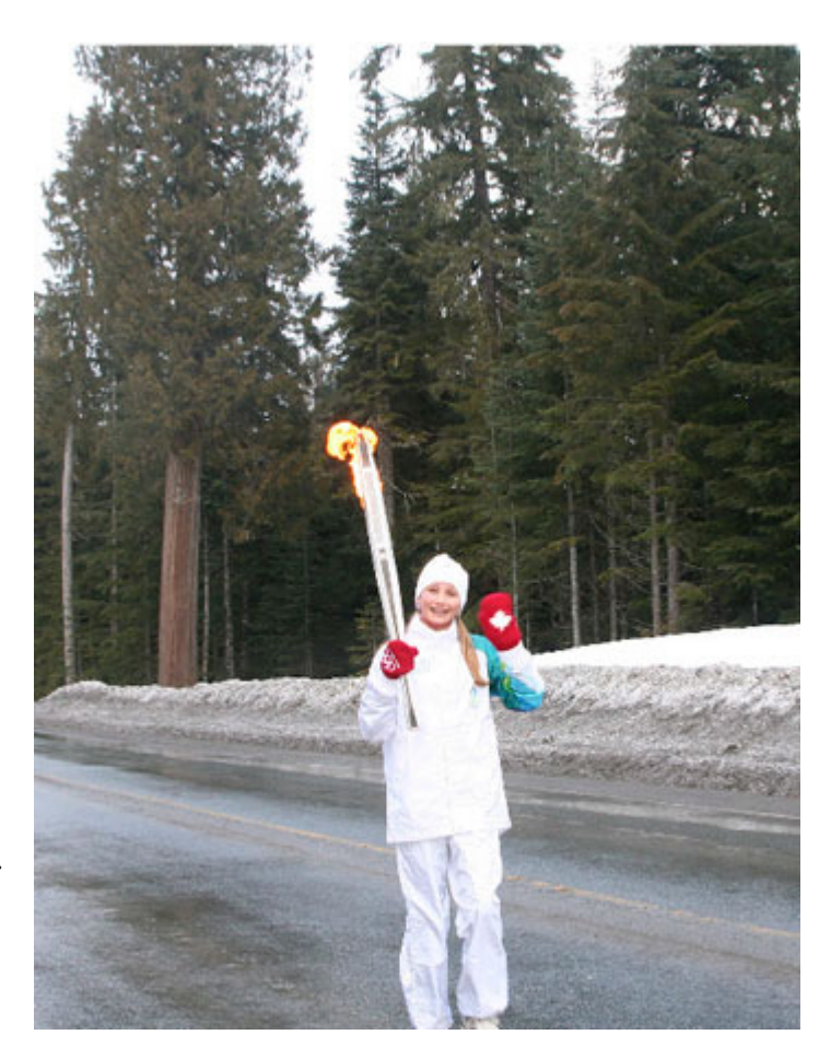
The Olympic torch passed the SSRC access road on its way to nearby Whistler Mountain and the 2010 Winter Games.

Yes. Greyhound runs about every 2 hours from Vancouver to a stop nearby SSRC.